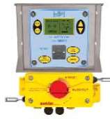
Amplifier Conveyor Station