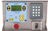
Communication and Lockout Station with Telephone Keypad