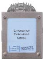
High Intensity Strobe (available in: Red, Yellow, White or Green)

These evacuation lights are located along the escape routes (egress) and linked together via a 2 core cable. The cable is used to power an internal relay which disconnects the internal battery.