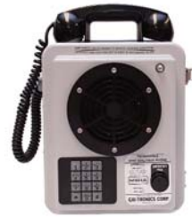
Mine Dial Page Telephone