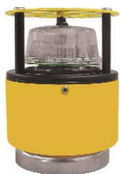
Strobe available in: Red, Yellow or White