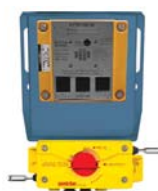
BMA with Pullswitch