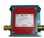
Tail End Unit