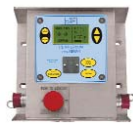
Communication and Lockout Station