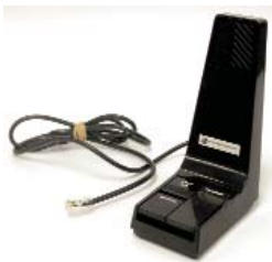
Model XDM002A Desk Microphone