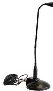
Model XDM005A Desktop Gooseneck Microphone