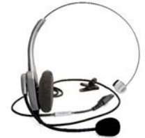
Model XHS003C Amplified Headset