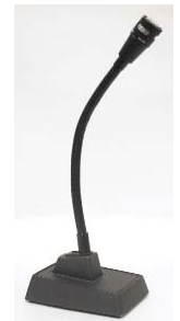
Model XDM003A Gooseneck Desk Microphone