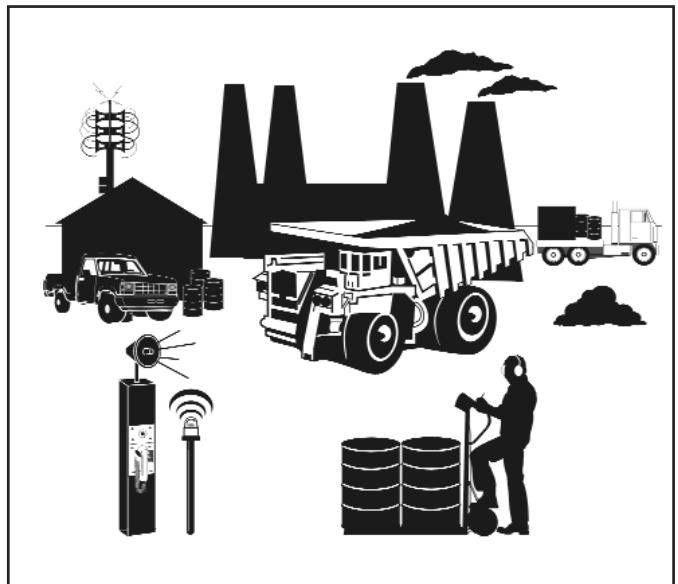
Figure 4. Acceptable solution: Tower signaling system integrated with distributed loudspeaker and/or visual indicators enhance employee awareness.