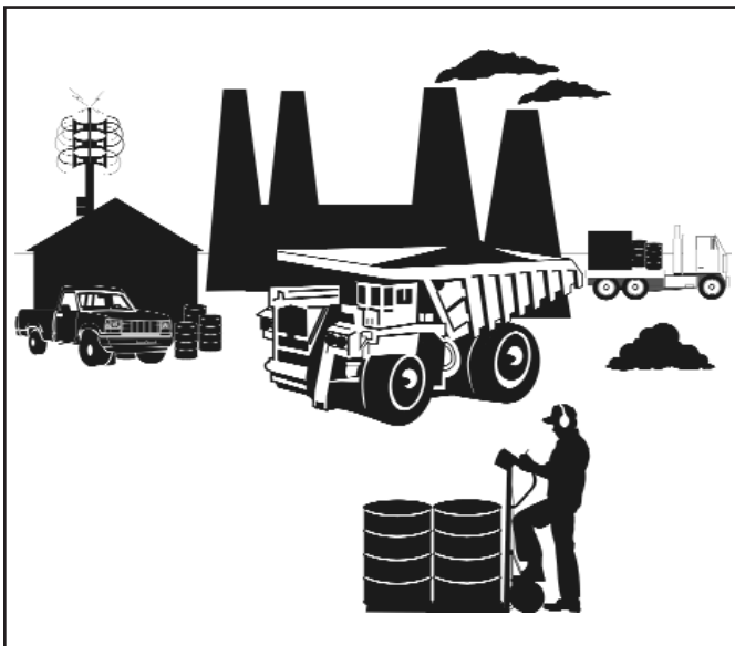
Figure 3. Unacceptable solution: Obstructions and noise producing machinery restrict intelligibility of alarm messages.

In some cases, it is possible that the sound levels created by operating machinery will surpass the ability of the speaker to broadcast an intelligible message as shown in Figure 3. The signal output level of the tower can be increased in order to compensate for the noise source; however, exceeding recommended output levels during alarm activation could cause hearing damage to personnel. In addition to the hearing damage, extremely loud broadcasts are also prone to distortion. Increasing the signal output level can be an acceptable solution provided the output level of the tower does not exceed the recommended decibel limit of 123dB.