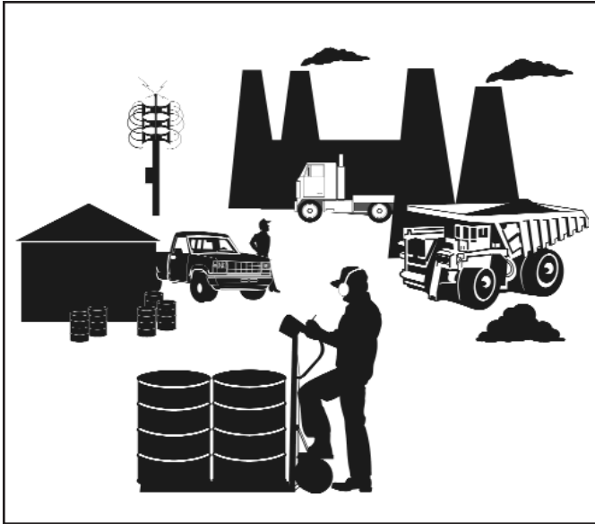
Figure 2. Acceptable solution: Minimal obstructions exist and tower is located near the noise source.